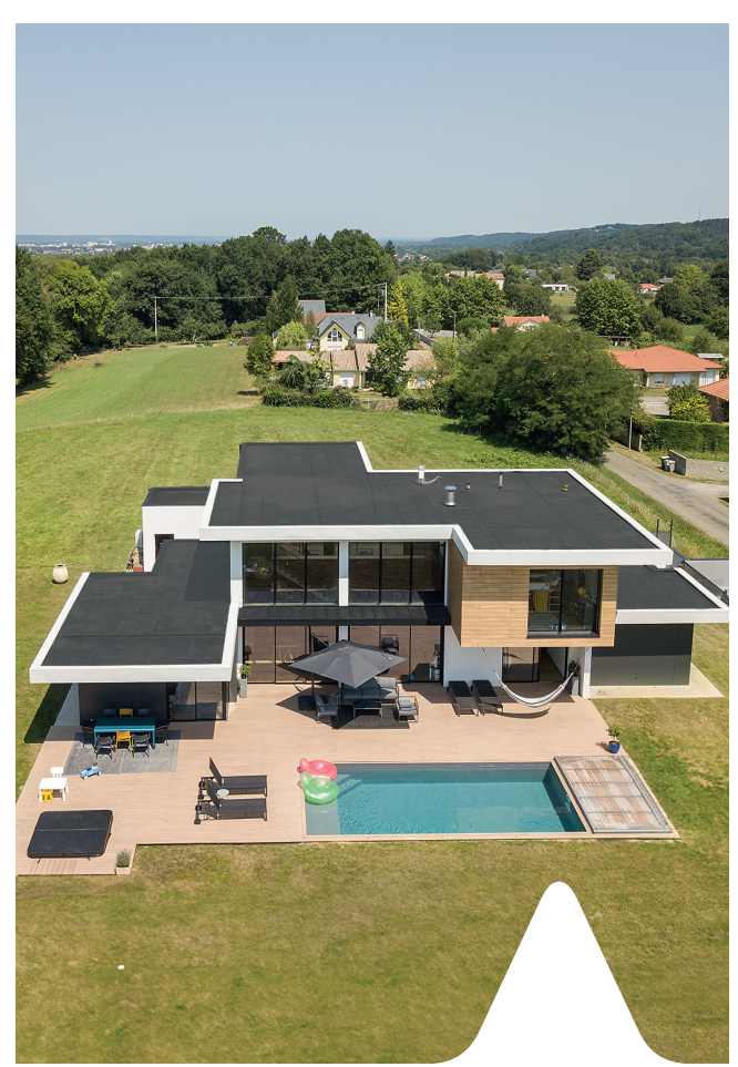
Individual house, Bernac-Debat (France) - Architect: Atelier Scenario -Product: EPDM membrane