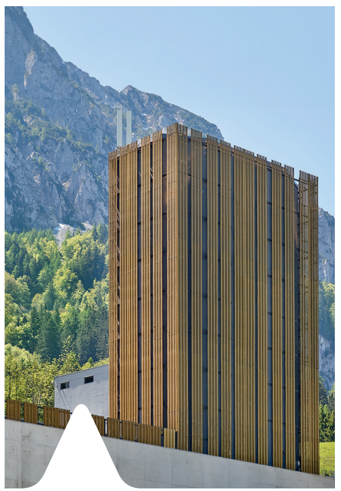
Bosruck Tunnel, Bosruck, Austria - Architect: Riepl Riepl Architekten -Copyright: Olaf Rohl - Product: Nordic Copper