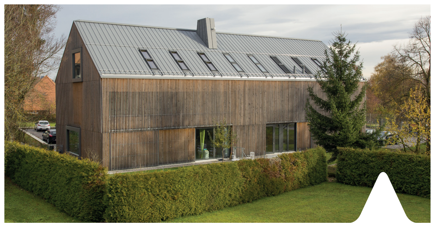
Gemeindezentrum, Gampelen (Suisse) - Architect: Spaceshop architekten GmbH, Biel - Product: VMZINC